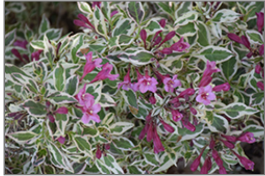
My Monet Weigela flowers

My Monet Weigela is recommended for the following landscape applications;