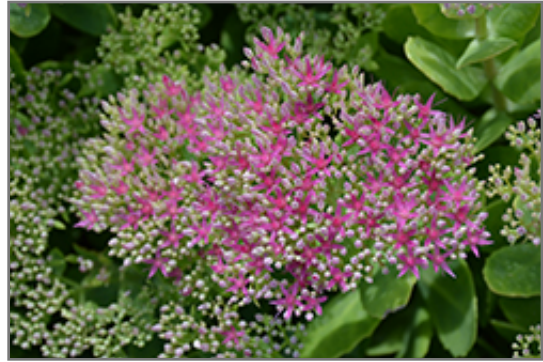
Neon Stonecrop flower buds