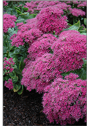
Neon Stonecrop flowers

Neon Stonecrop is a dense herbaceous perennial with an upright spreading habit of growth. Its relatively coarse texture can be used to stand it apart from other garden plants with finer foliage.