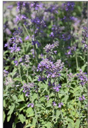
Little Trudy Catmint flowers