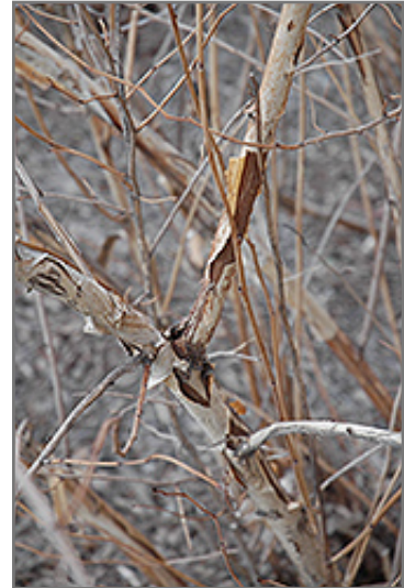
Diablo Ninebark bark

This shrub does best in full sun to partial shade. It is very adaptable to both dry and moist locations, and should do just fine under average home landscape conditions. It is not particular as to soil type or pH. It is highly tolerant of urban pollution and will even thrive in inner city environments. This is a selection of a native North American species.