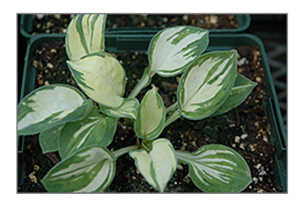
Cherish Hosta foliage