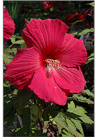
Sultry Kiss Hibiscus flowers

This bold garden perennial features showy ruffled, large hot pink flowers that are produced at the nodes all up the stems; attractive, glossy, dark-green/bronze leaves; ideal for the mixed garden border or in mass; do not allow to dry to wilting point