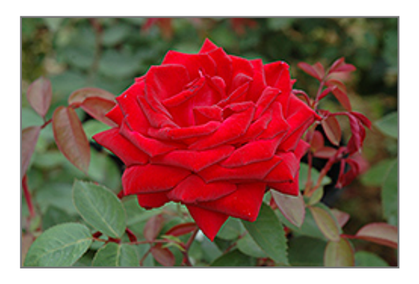
Kashmir Rose flowers

Kashmir Rose is recommended for the following landscape applications;