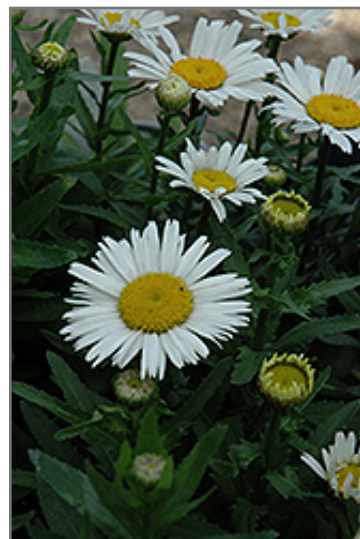
Snow Lady Shasta Daisy flowers

Snow Lady Shasta Daisy is recommended for the following landscape applications;