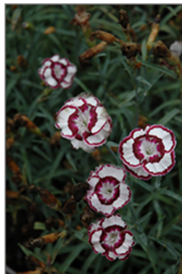
Raspberry Swirl Pinks flowers

Raspberry Swirl Pinks is recommended for the following landscape applications;