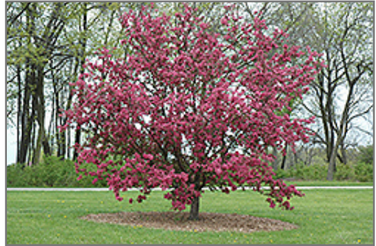
Purple Prince Flowering Crab in bloom

This tree will require occasional maintenance and upkeep, and is best pruned in late winter once the threat of extreme cold has passed. It is a good choice for attracting birds to your yard. It has no significant negative characteristics.