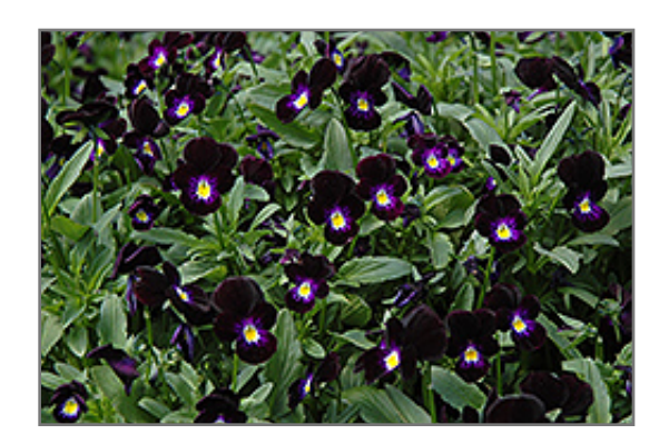
Bowles Black Pansy flowers