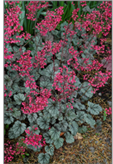
Rave On Coral Bells in bloom

Rave On Coral Bells is recommended for the following landscape applications;