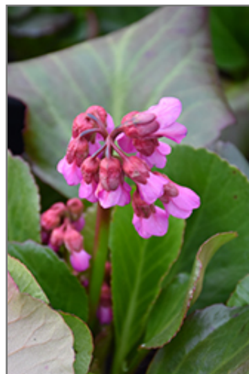
Bressingham Ruby Bergenia flowers