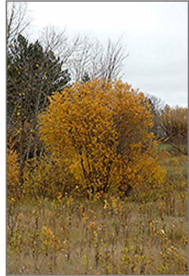
Pussy Willow in fall

This shrub does best in full sun to partial shade. It is quite adaptable, preferring to grow in average to wet conditions, and will even tolerate some standing water. It is not particular as to soil type or pH. It is somewhat tolerant of urban pollution. This species is native to parts of North America.