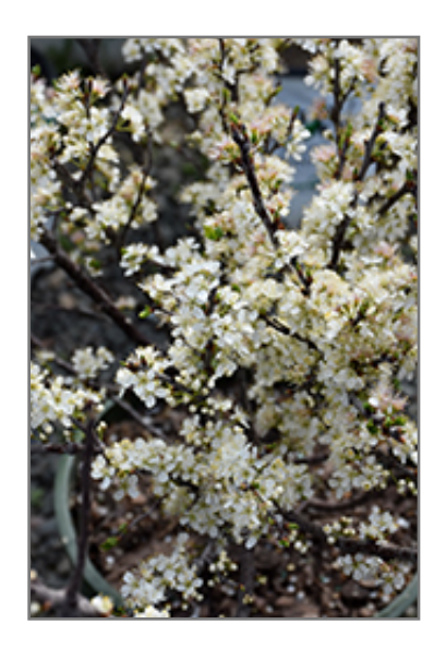
Beach Plum flowers