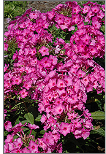
Flame Pink Garden Phlox flowers