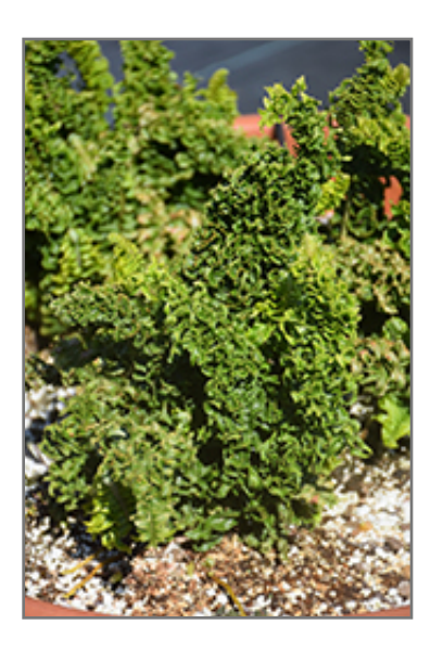
Emina Curly Boston Fern

Burlington Garden Center: CurbsideBurlington@gardeners.com | Williston Garden Center: CurbsideWilliston@gardeners.com Lebanon Garden Center: CurbsideLebanon@gardeners.com | Hadley Garden Center: CurbsideHadley@gardeners.com gardeners.com/store