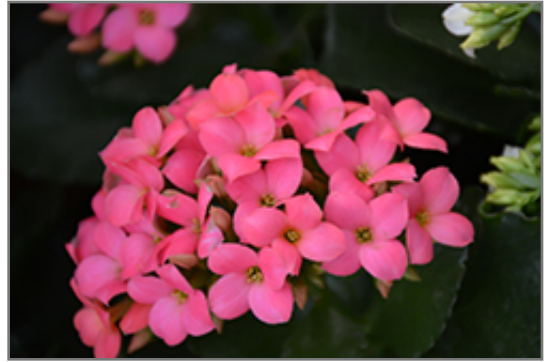
Coral Kalanchoe flowers