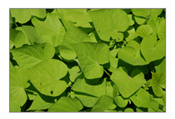
Sweetheart Lime Sweet Potato Vine foliage

Sweetheart Lime Sweet Potato Vine is primarily valued in the home for its spreading and trailing habit of growth. Its heart-shaped leaves remain lime green in color throughout the year.