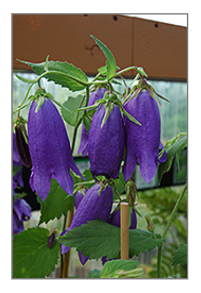
Sarastro Bellflower flowers