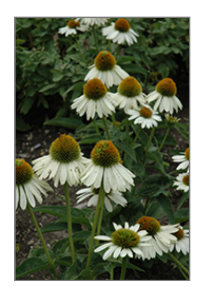
Sombrero Blanco Coneflower flowers