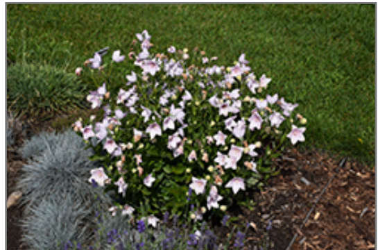
Astra Pink Balloon Flower in bloom