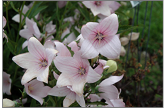
Astra Pink Balloon Flower flowers