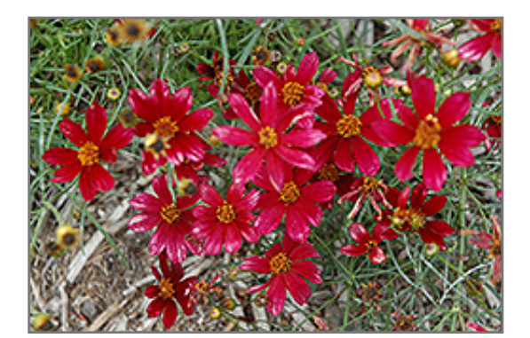
Main Street Tickseed flowers

Burlington Garden Center: CurbsideBurlington@gardeners.com | Williston Garden Center: CurbsideWilliston@gardeners.com Lebanon Garden Center: CurbsideLebanon@gardeners.com | Hadley Garden Center: CurbsideHadley@gardeners.com gardeners.com/store