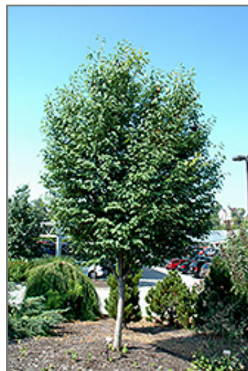
Lustre Allegheny Serviceberry

Lustre Allegheny Serviceberry will grow to be about 20 feet tall at maturity, with a spread of 15 feet. It has a low canopy with a typical clearance of 4 feet from the ground, and is suitable for planting under power lines. It grows at a medium rate, and under ideal conditions can be expected to live for 40 years or more. While it is considered to be somewhat self-pollinating, it tends to set heavier quantities of fruit with a different variety of the same species growing nearby.