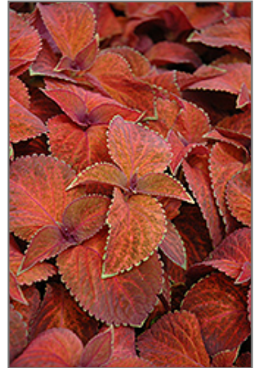
Wizard Sunset Coleus foliage

Wizard Sunset Coleus is recommended for the following landscape applications;