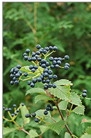
Blue Muffin Viburnum fruit

Blue Muffin Viburnum is recommended for the following landscape applications;