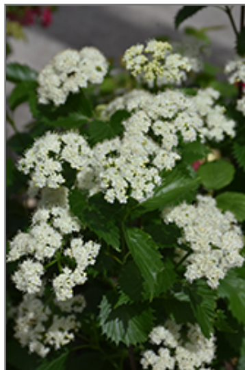
Blue Muffin Viburnum flowers