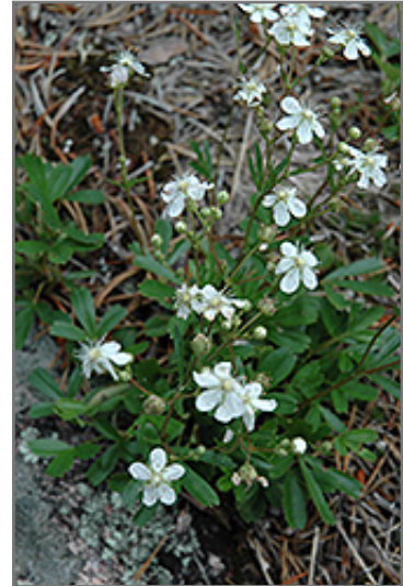
Three Toothed Potentilla flowers