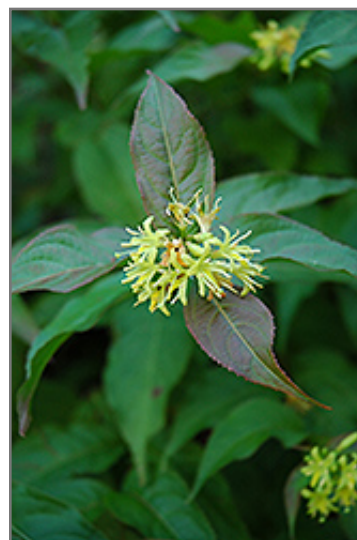
Bush Honeysuckle flowers