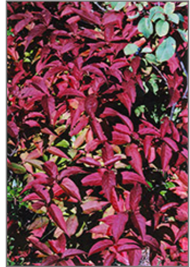
Bush Honeysuckle in fall

This shrub does best in full sun to partial shade. It is very adaptable to both dry and moist locations, and should do just fine under average home landscape conditions. It is not particular as to soil type or pH. It is highly tolerant of urban pollution and will even thrive in inner city environments. This species is native to parts of North America.