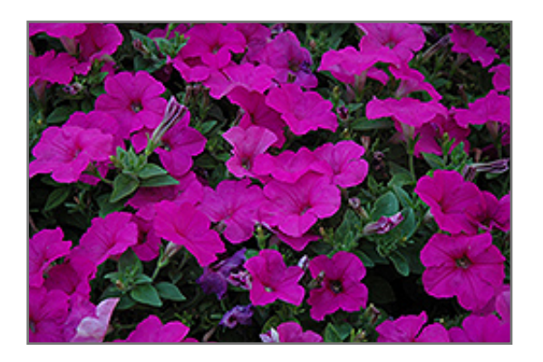
Easy Wave Neon Rose Petunia flowers