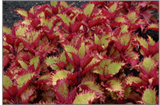
Henna Coleus foliage