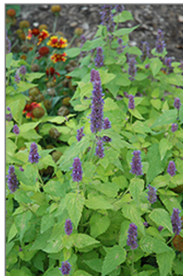
Golden Jubilee Anise Hyssop flowers

This is a relatively low maintenance plant, and is best cleaned up in early spring before it resumes active growth for the season. It is a good choice for attracting bees, butterflies and hummingbirds to your yard, but is not particularly attractive to deer who tend to leave it alone in favor of tastier treats. It has no significant negative characteristics.