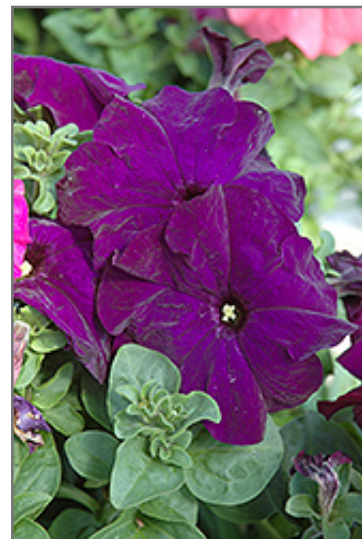
Dreams Midnight Petunia flowers