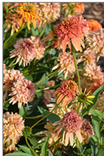
Cone-fections Marmalade Coneflower flowers